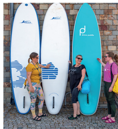
Stand-up paddleboard is a fun way to explore.