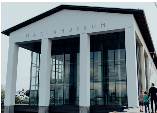
The Naval Museum is a treat for all ages.