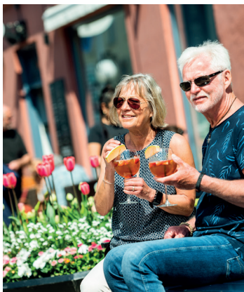
Enjoy a refreshment in the city center.