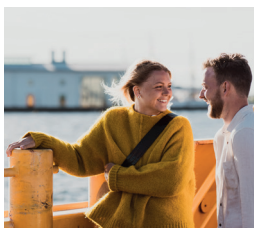
Take the ferry to Aspö.