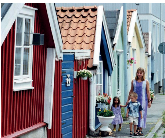
Charming area of Björkholmen.