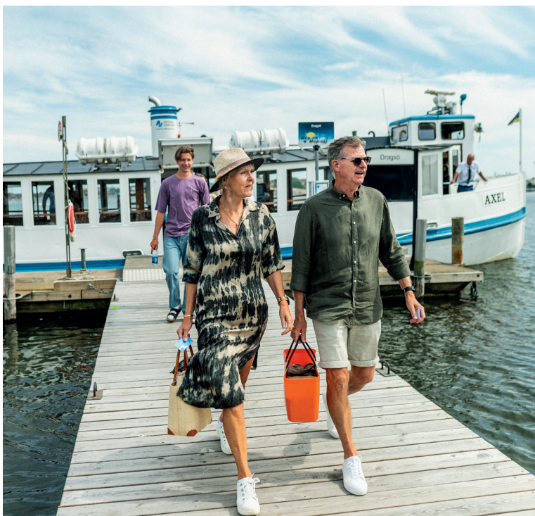
Hop-on hop-off archipelago boats.