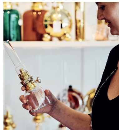
Local shopping, Karlskrona Lamp Factory.