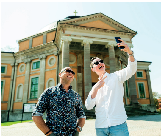
The Trinity Church (German Church).