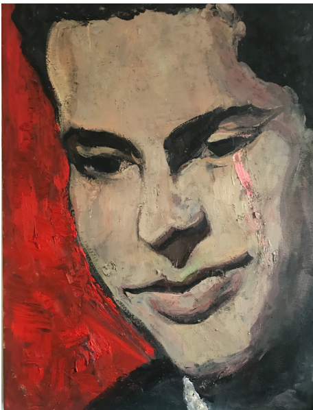
A portrait of André Tchaikowsky by Rodolfo Villaplana